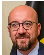
European Council President Charles Michel (Belgium) ADLE Term of office: December 1 st 2019- May 31 th , 2022 (2 ½ years) Designed by all European national leaders