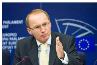
First Vice –Président of the European Parliament Othmar Karas (Autriche) PPE Term of office : 2022-2024 (2 years ½) Elected by MEP