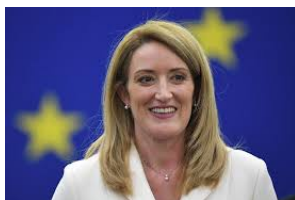
European Parliament President Roberta Metsola (Malte) PPE Term of office: 2022- 2024 (2 years ½) Elected by MEP